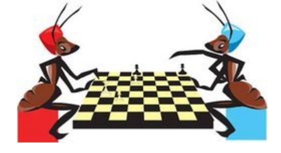
Play as much as possible.